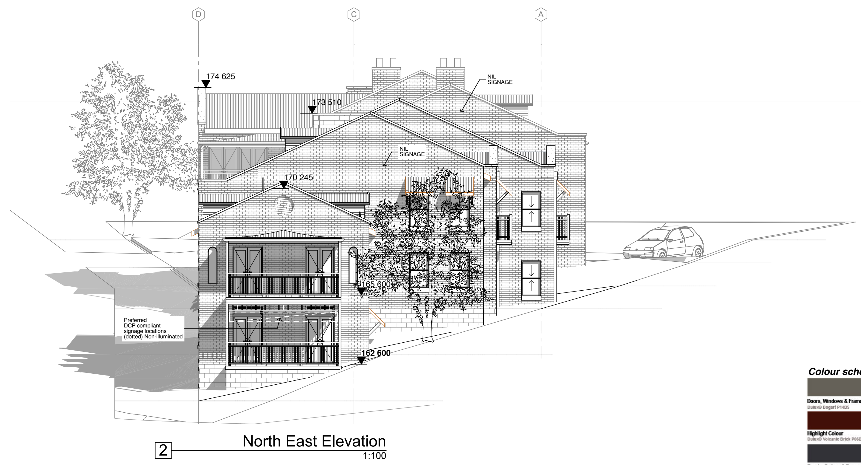
Figure 2 – Acceptable and unacceptable sign locations